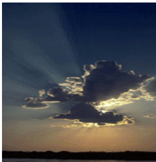
Journey of Men : A Context for Hope, Growth and Change